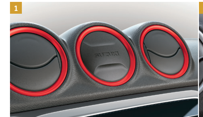
1 | A/C Louver Ring Set1 Bright Red 5, six-piece set. Part No. 990E0-54P74-ZCF