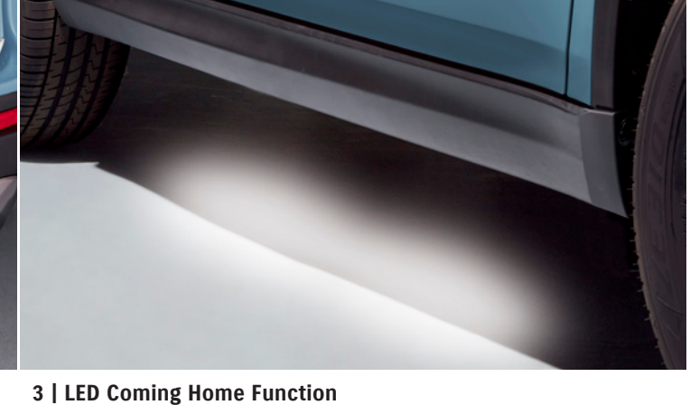
Upon opening front doors, the area below the front doors of the vehicle is illuminated to assist passengers to find their way.